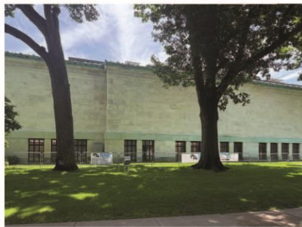
EXTERIOR ELEVATION - WEST