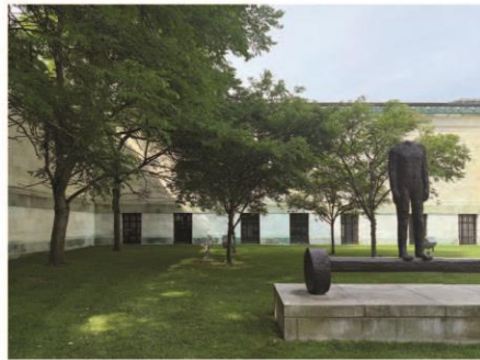
EXTERIOR ELEVATION - NORTH