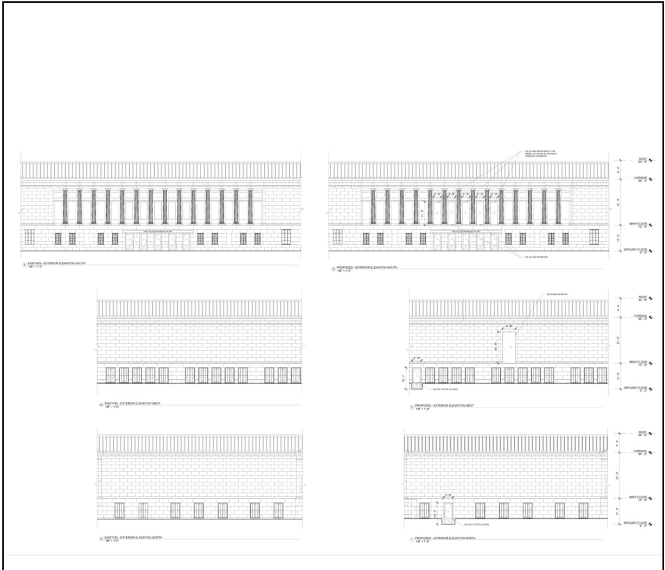
Exhibit "D" Elevations