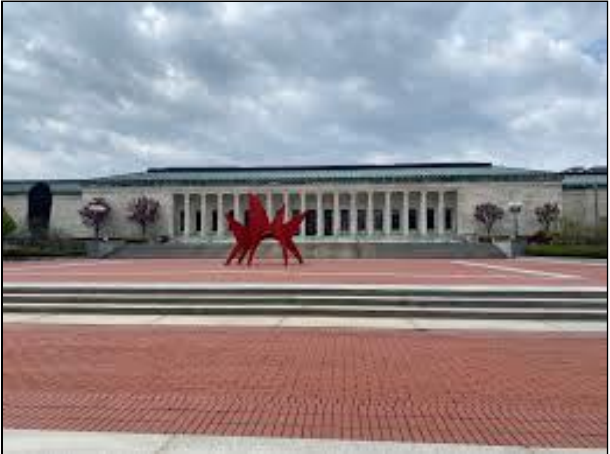
Exhibit "B" Front of House