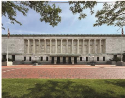
EXTERIOR ELEVATION - SOUTH